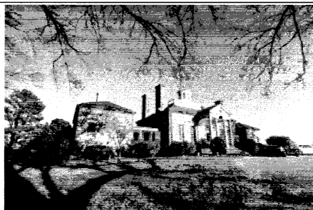
The Dillard Mansion Amherst Co., Virginia