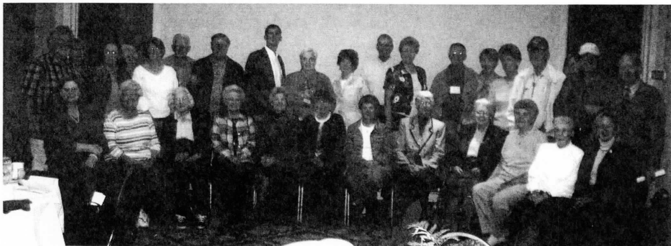
Family at the 2006 Rucker Reunion